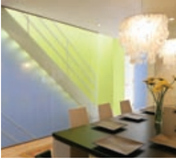
Transitional Color 1