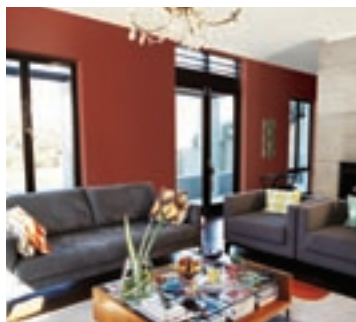
Transitional Color 1

Color can be used to visually connect multiple rooms.